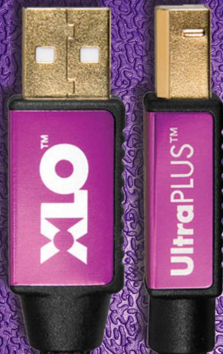
UP-4U High Resolution USB 2.0 DataLink Cable